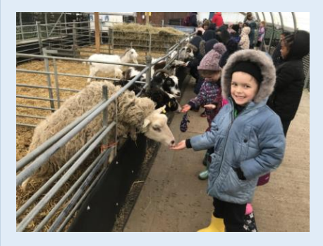
During their visit to Hall Hill Farm they learnt all about farming and met lots of baby animals. They even learnt how to milk a cow!

They have also been focusing on the importance of team work and have enjoyed sharing their creative ideas with their friends outside. During dance in PE, they practiced taking turns by pulling their friends along in a game of boat rides to make their arms strong!