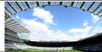
St. James Park