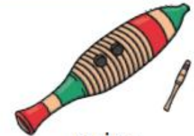
guiro or scrapers