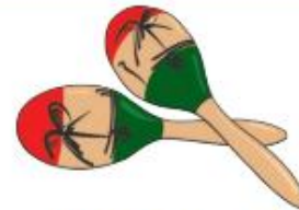
maracas or shakers