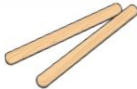
claves or sticks